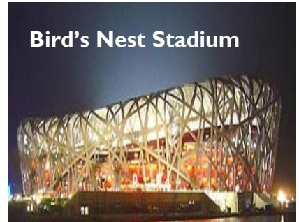
Bird's Nest Stadium